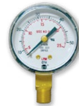
GA136-03 1/4 NPT

Sintered filter to prevent debris from entering torch. Installs inside Smith "B" torch inlet connections.