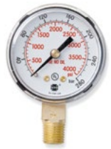
GA139-03 1/4 NPT