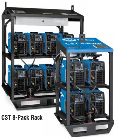
CST 8-Pack Rack