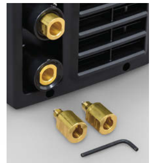
CST 282 with Tweco-style receptacles shown.

Universal connector system allows the machine to be quickly configured to either Tweco®- or Disne-style receptacles. Extra receptacles and wrench shown are sold separately as Universal Connector Kits (see page 4).