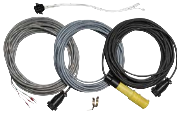
Spectrum 875 Auto-Line automation kit shown.

Automation Kits for Spectrum 875 and 875 Auto-Line 301156 For Spectrum 875.