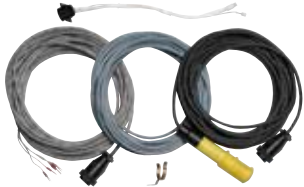
Automation kit (301157) shown.

Includes front panel with built-in remote control cable receptacle. Machine torches are NOT included in kits and must be ordered separately.