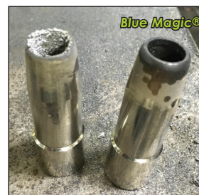
Blue Magic® (right) and another anti-spatter (left) that was not formulated for high heat & high spatter industrial use, after 32 welds.