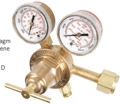
SR250 FLOW DATA