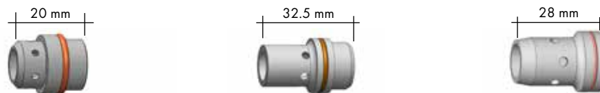
Gas diffuser w/o-ring (10 pcs.)