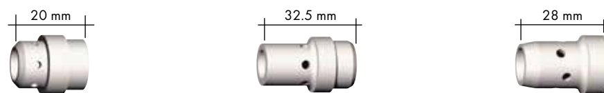
Gas diffuser (10 pcs.)