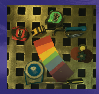
9002NC ADF Shade 3

Improved optics in the Speedglas 9002NC welding filter helps you see your welds in a new light, providing more contrast and natural-looking color as shown in these photos.