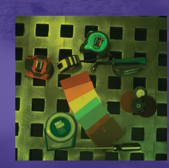
9000X ADF Shade 3