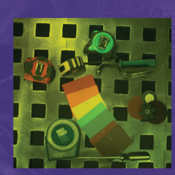
Sample Competitor ADF Shade 3